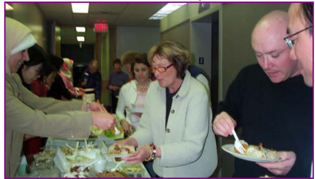
Above: Ethnic Food Fair ... a different flavour brings many hungry customers!

The LINC students and teachers presented an ethnic food fair for two days in November. Posters were placed in the building to advertise the fair, which resulted in a high turnout with many occupants coming to sample the food. It was a wonderful success, raising more than $500 for United Way.